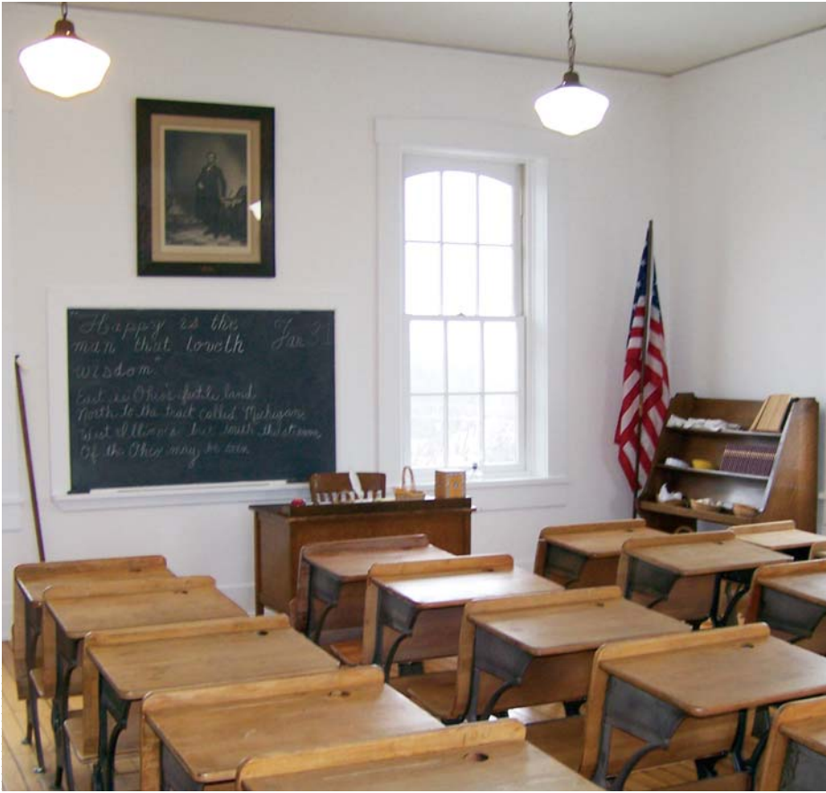
One-room school room in the Academy of Hoosier Heritage museum in the Academy Building.