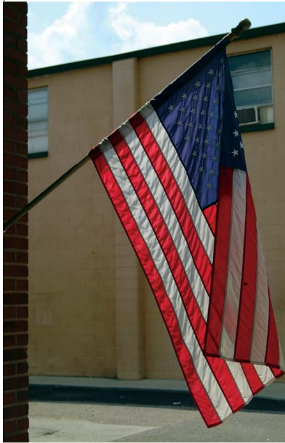
Main Street in Morgantown

Please watch for this section in each future newsletter where you will find a wide variety of giving options. Some are simple, others are more complex. Perhaps one will suit your needs.