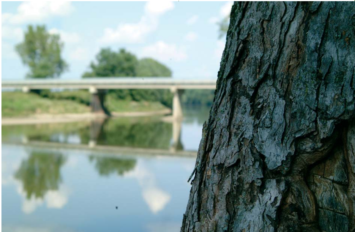
Henderson Ford Bridge in Green Township

In 1838, Ezekial St. John laid out the first town in Green Township, called Cleveland; the village died out. The village of Cope was settled several years later and still thrives today. The town of Exchange is also in Green Township.