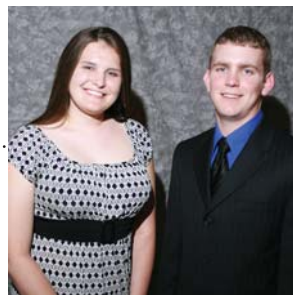
Lilly Endowment Community Scholarship Dinner - April