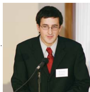
Kendrick Foundation Scholarship Dinner - May