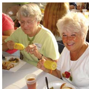
Fired Up for Philanthropy Annual Dinner - August