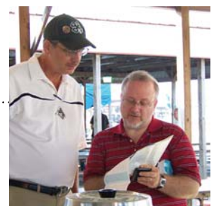
Morgan County Farmer's Breakfast - July