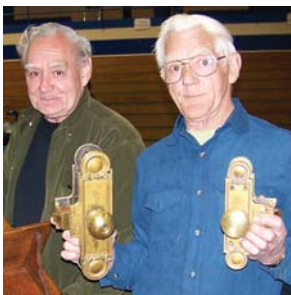
Morgan County Antique Appraisal Fair - April