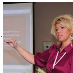
Women in Control Conference - October