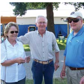
Morgan County Fair Sponsor of the Day - July