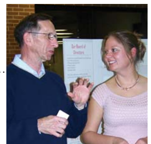
Morgan County Scholarship Fair - December