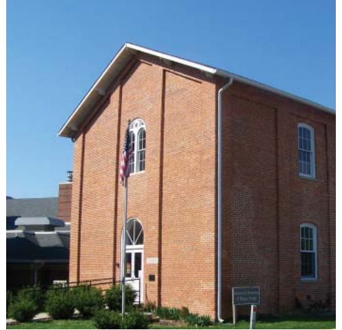
The Community Foundation of Morgan County, Inc. is housed in the historic Academy Building in Mooresville, Ind.

In 2001, the Kendrick Foundation, Inc. joined the Community Foundation of Morgan County, Inc. as a supporting organization.