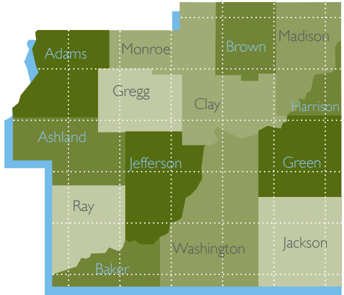
Morgan County, Indiana

We are more than a financial resource; we are striving to serve as the county's information hub. Together with community leaders and local organizations, we're pooling resources to provide opportunities for coordinated impact.