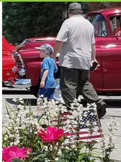
Visit Morgan County