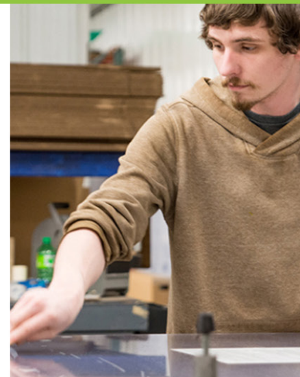
Morgan County Economic Development Corporation and MWP Images