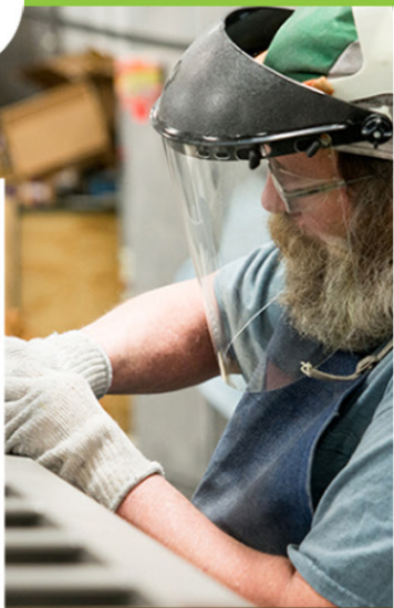
Morgan County Economic Development Corporation and MWP Images